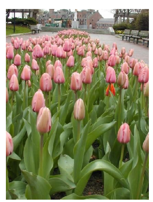
Tulips - Copenhagen - V. Cornell

We are also beginning to see the dichotomy