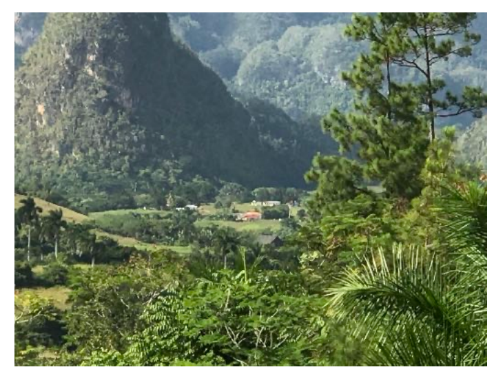
Cuba - Valle de Viñales

We also have Healthcare issues. The medical profession is a mess: overcharging, sending seriously ill patients into debt, despite the so-called health care act. And pharmaceutical greed. Then there is Covid!