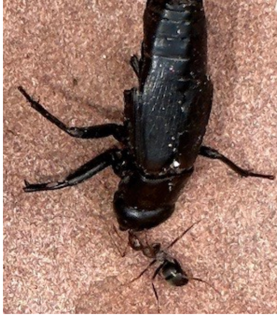
An Ant Carrying a Cricket (if he can do the impossible, so can you)

Pluto will be the first planet to go direct on October 10th, after having been retrograde for about 5 months. Pluto is always a difficult planet, retrograde or not, because it teaches one about polarity. It's the farthest from the Sun and brings life changing challenges. A tiny planet that carries a big bang, it brings us to our knees or wakes us up to grow. At its worse it is hubris. It has been retrograde for a long time allowing those in public office to do a great deal of research regarding issues that seem to be